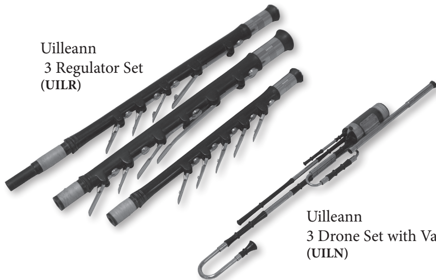
Uilleann 3 Drone Set with Valve (UILN)